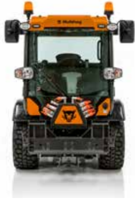
MXC LP SPECIFICATION